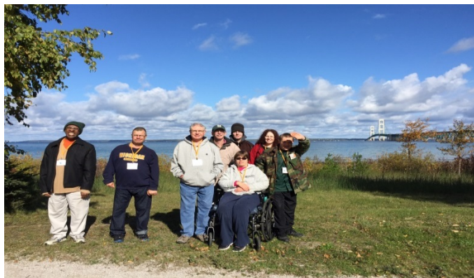
MACKINAW TRIP – 2014